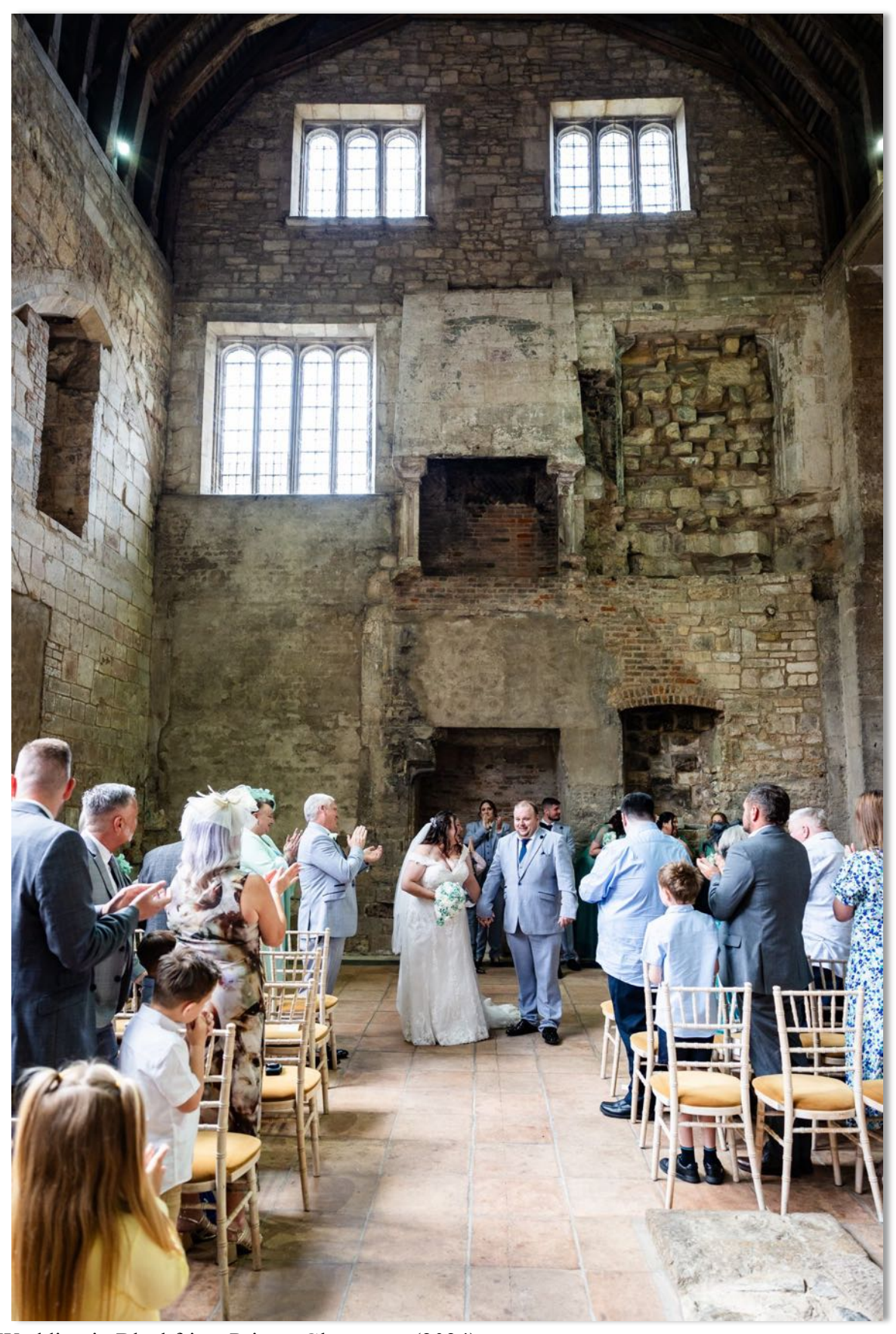
Wedding in Blackfriars Priory, Gloucester (2024)