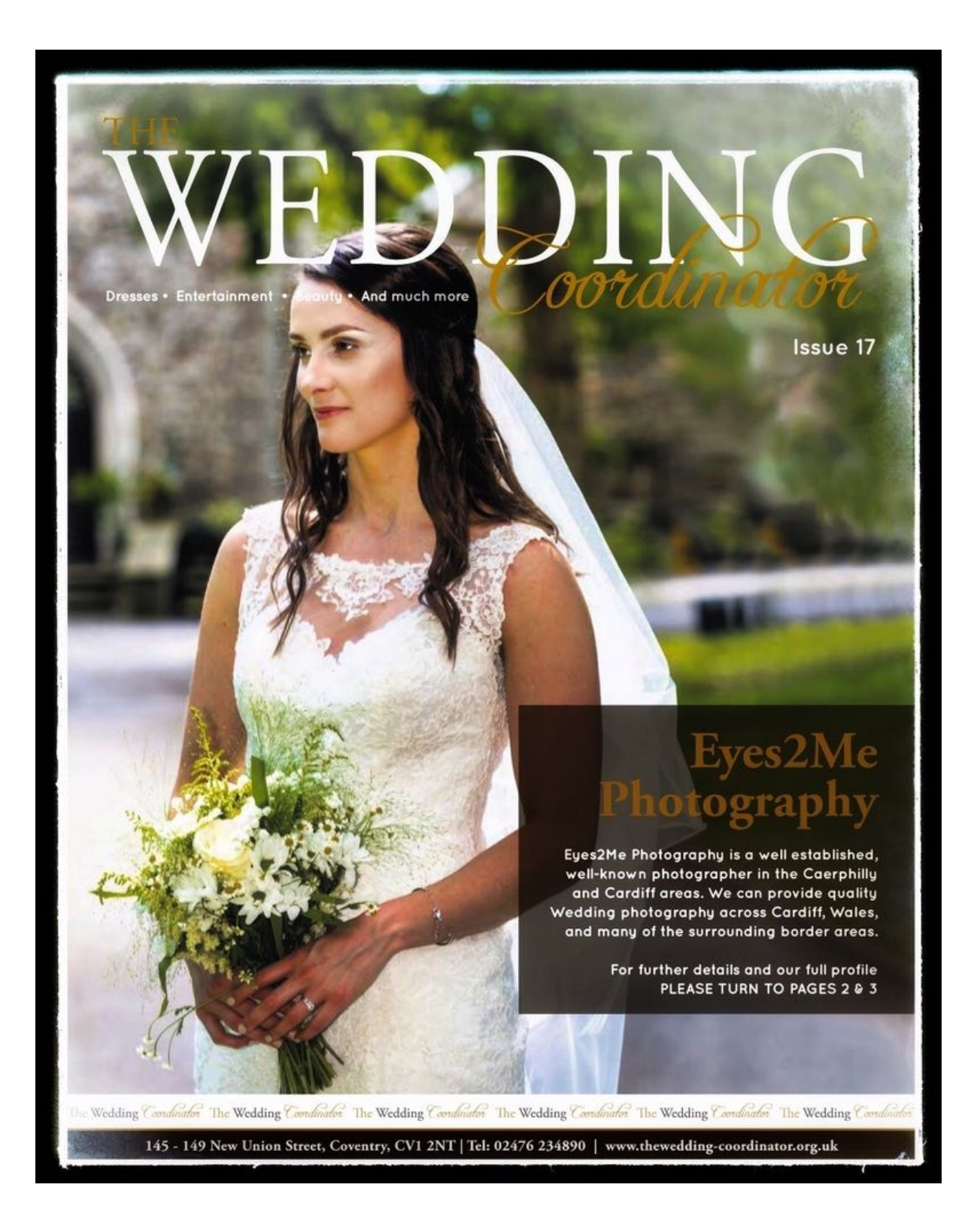
Front Cover of Wedding Coordinator magazine: Wedding Photographer of the year, 2019